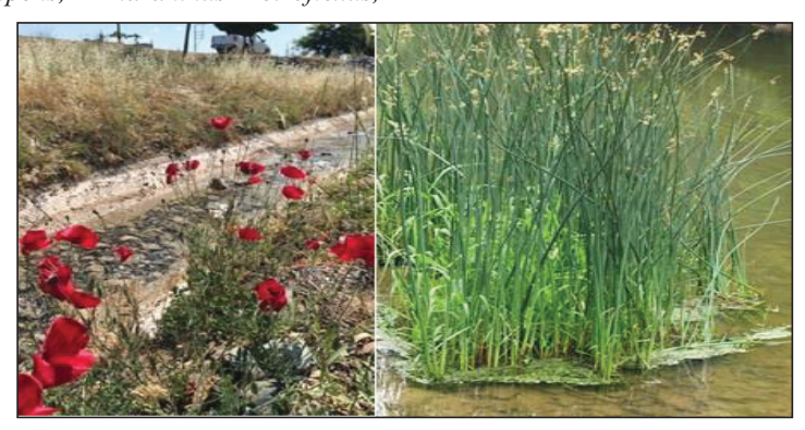
Figure 6. Papaver rhoeas and Equisetum arvense

Echinochloa crus- galli, Dactylis glomerata, Lolium temulentum, Digitaria sanguinalis, Sorghum halepense, Sinapis Arvensis, Anchusa officinalis, Bromus tectorum, Avena fatua, Phragmites australis, Cuscuta campestris, Portulaca oleracea, Convolvulus arvensis, Poa trivialis, Rumex crispus, Chenopodium album and Aegilops columnaris.