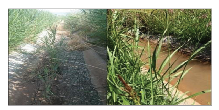
Figure 8. Phragmites australis and Sorghum halepense

Anchusa officinalis, Aegilops columnaris, Poa trivialisve Cyperus rotundus were found intensely. There are 58 different weed species from 15 families diagnosed at the edge of closed irrigation channels. In the district, it has been determined that the species of Agapyron repens, C. dactylon Alopecurus myosuroides. Bromus arvensis. Avena sterilis. Setaria verticillata, Dactylis glomerata, Matricaria chamomilla, Chenopodium album, Digitaria sanguinalis, Convolvulus arvensis, Lolium temulentum. Papaver rhoeas. Portulaca oleracea and Sinapis arvensis are intense.