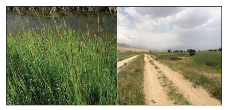
Figure 5. Alopecurus myosuroides and Setaria viridis

Digitaria sanguinalis, Amaranthus retroflexus, Setaria viridis, Convolvulus arvensis, Agropyron repens, Avena fatua, Chenopodium album, Bromus tectorum, Matricaria perforate, Cuscuta campestris, Echinochloa crus-galli and Phragmites australis.