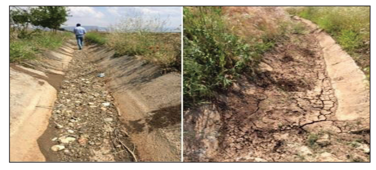
Figure 10. Problems of gravel and soil residues that accumulate in irrigation channels

In the open irrigation channels, the number and density of weed species, especially seen on the soil surface and along the secondary channels, were determined at the highest level. In addition, since there is no continuous water in these irrigation channels, weeding of the weed in the canal was found to be considerably high as the soil was accumulated in the soil of the canal (Figure 10). This reduces the speed and the flow of irrigation water. In addition, because weed seeds will be poured into the canal, they cause direct transport to the fields.