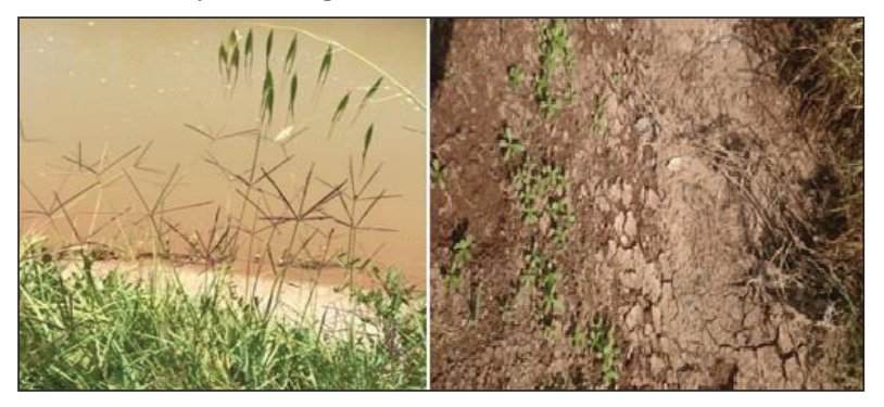
Figure 3. Cynodon dactylon and Portulaca oleracea L. on the edge of irrigation channals

mvosuroides, Sorghum halepense, Setaria verticillata. Bromus tectorum. Dactvlis glomerata, Matricaria chamomilla. Avena sterilis, Digitaria sanguinalis, Anchusa Sinapis arvensis, Chenopodium officinalis, album. Phalaris canariensis. Convolvulus arvensis. Rubus canasences (Figure 3).