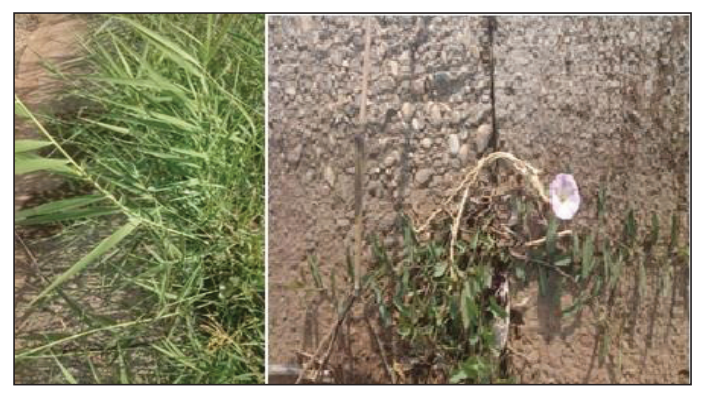
Figure 4. Phragmites australis and Convolvulus arvensis on the edge of irrigation channals

There are 62 different weed species from 18 families diagnosed at the edge of closed irrigation channels. In the district: Agropyron repens, C. dactylon Alopecurus myosuroides, Bromus arvensis, Avena sterilis, Setaria verticillata, Dactylis glomerata, Matricaria chamomilla, Chenopodium album, Digitaria sanguinalis, Convolvulus arvensis, Lolium temulentum, Papaver rhoeas, Portulaca oleracea, Sinapis arvensis, Bromus tectorum and Phalaris canariensis (Figure 4).