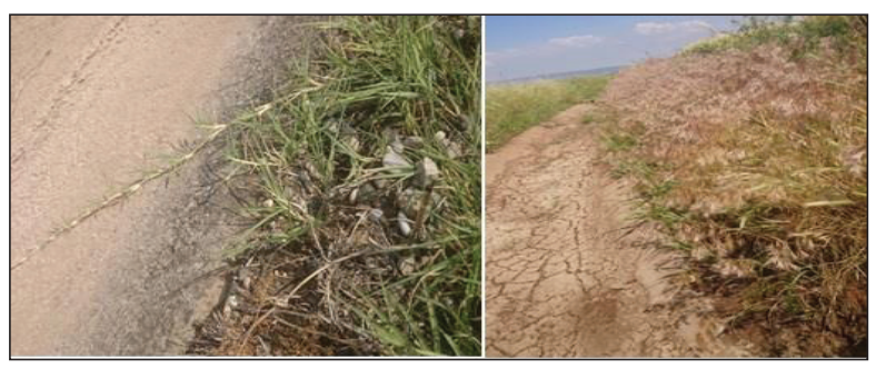
Figure 2. Agropyron repens and Bromus arvensis on the edge of the irrigation channels

retroflexus, Echinochloa crus-galli, Phragmites australis, Chenopodium album, Setaria viridis, Dactylis glomerata, Sinapis arvensis, Hordeum vulgare, Phalaris canariensis, Lolium temulentum, Convolvulus arvensis, Rumex crispus, Matricaria perforata, Bromus tectorum, and Cuscuta campestris species were found to be dense (mean plants 1-10 in m²) (Figure 2).