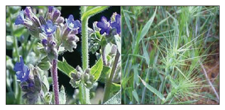
Figure 9. Anchusa officinalis and Aegilops columnaris

chamomilla, Chenopodium album, Digitaria sanguinalis, Convolvulus arvensis, Papaver rhoeas and Sinapis arvensis (Figure 9).