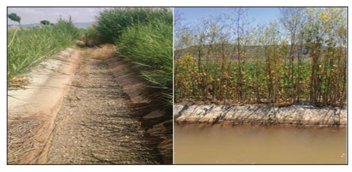
Figure 7. Phragmites australis and Sinapis arvensis